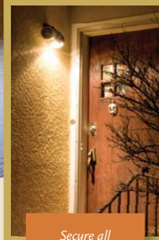
Secure all points of entry and keep them well-lit.