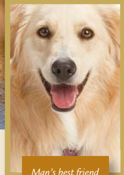
Man's best friend is still an intruder's worst nightmare.