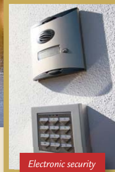
Electronic security systems are a great investment and add to your home's value.