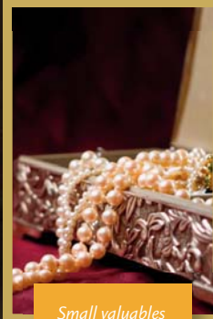
Small valuables are a thief's number one target.

Fortunately, burglars will often move on if they see you have taken preemptive measures.